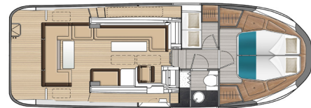
Lower deck - 2 cabins / 1 head