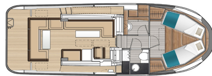
Lower deck - 1 cabin / 1 head