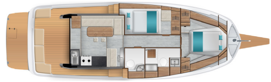
Lower deck - 2 cabins / 2 heads